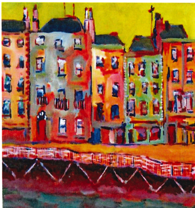
Ormond Quay, Dublin by Christy Brown